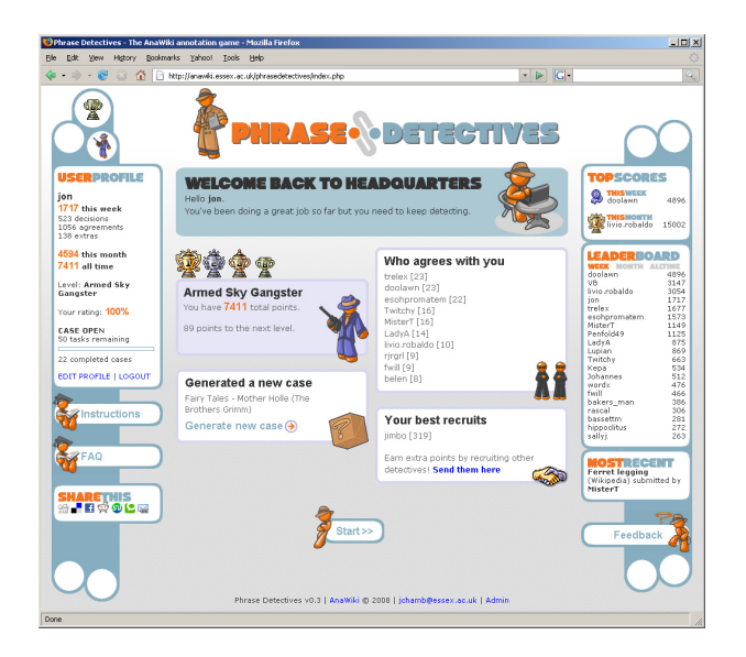
Figure 3: A screenshot of the player's homepage.

influence on the scoring, players complained that they felt under pressure and that they didn't have enough time to check their answers. This is in contrast to previous suggestions that timed tasks motivate players [23]. The timing of the annotations is now hidden from the players but still recorded with annotations. The relationship between the time of the annotation, the user rating and the agreement will be crucial in understanding how a timed element in a reading game influences the data that is collected.