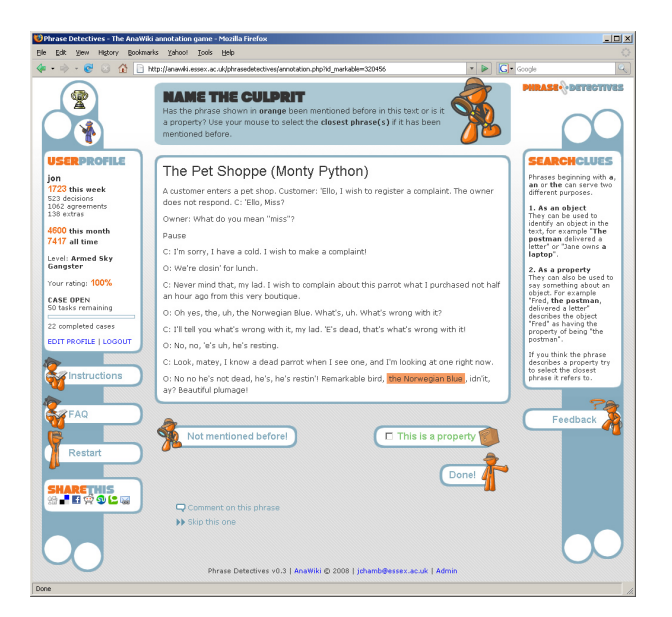
Figure 1: A screenshot of the Annotation Mode.